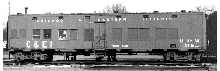
One of the troop cars in maintenance service on the C&EI. Most cars were heavily modified by the railroads, but the car we plan to acquire is unmodified and nearly complete.

Clip this form and mail it to: Haley Tower Historical & Technical Society PO Box 10291, Terre Haute, IN 47801 Attn: Troop Sleeper Project